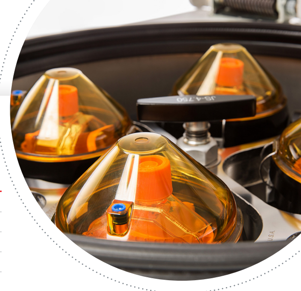
Table 3: Cell Culture Flask Adapters (EPDM)