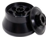
VFC 8.50 BIOC

24 x 15 mL conical tubes Max speed: 11,431 x g (9,000 rpm)