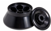
VF 6.250 BIOC

6 x 94 mL tube rotor with Biosafe lid Max speed: 11,872 x g (10,000 rpm)