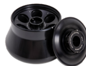
VF 6.94 BIOC

8 x 50 mL conical tube rotor with BioSafe Lid Max speed: 15,032 x g (11,360 rpm)